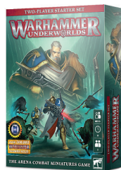
Warhammer Underworlds: Starter Set

These are all fantastic entry points for someone who wants to get into the Warhammer hobby. They contain everything you need to start playing, including two opposing forces, so they're easy to share with a friend. Plus the scaling price points offer increasing levels of value depending on their commitment level and starting budget.