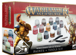
Warhammer Age of Sigmar Paint + Tools Set

Both of these boxes are robust offerings designed to work with the 'starter boxes' products listed above.