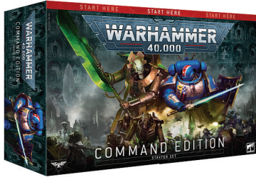
Warhammer 40,000: Command Edition