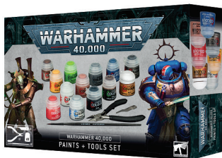
Warhammer 40,000 Paint + Tools Set

Each box includes easy-to-assemble miniatures and the paints an aspiring hobbyist needs to complete their first models and see how they like it.