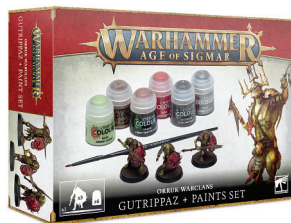
Orruk Wardlans Gutrippaz + Paint Set