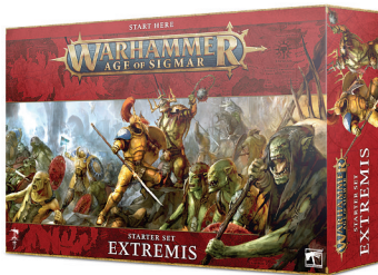
Warhammer Age of Sigmar: Extremis