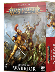
Warhammer Age of Sigmar: Warrior