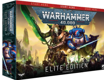
Warhammer 40,000: Elite Edition