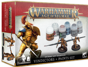
Stormcast Eternals Vindictors + Paint Set