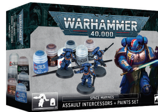
Space Marines: Assault Intercessors + Paint Set