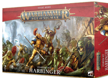
Warhammer Age of Sigmar: Harbinger