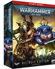
Warhammer 40,000: Recruit Edition