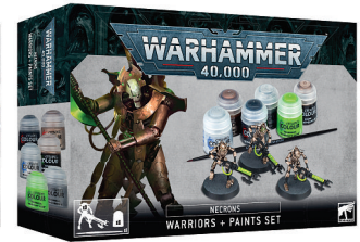
Necrons: Warriors + Paint Set

Each box includes easy-to-assemble miniatures and the paints an aspiring hobbyist needs to complete their first models and see how they like it.