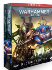
Warhammer 40,000: Recruit Edition