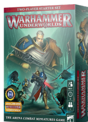
Warhammer Underworlds: Starter Set

These are all fantastic entry points for someone who wants to get into the Warhammer hobby. They contain everything you need to start playing, including two opposing forces, so they're easy to share with a friend. Plus the scaling price points offer increasing levels of value depending on their commitment level and starting budget.