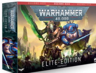
Warhammer 40,000: Elite Edition