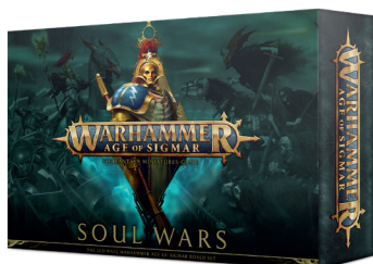
Warhammer Age of Sigmar: Soul Wars