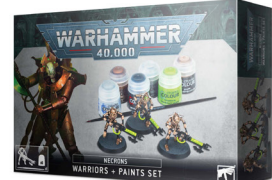
Necron Warriors + Paint Set

Each box includes easy-to-assemble miniatures and the paints an aspiring hobbyist needs to complete their first models and see how they like it.