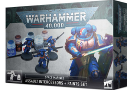
Space Marines: Assault Intercessors + Paint Set