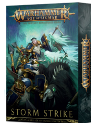
Warhammer Age of Sigmar: Storm Strike