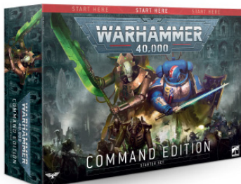
Warhammer 40,000: Command Edition