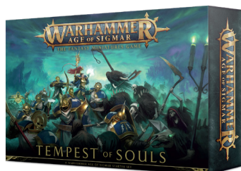
Warhammer Age of Sigmar: Tempest of Souls