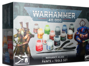
Warhammer 40,000 Essentials Paint Set

Each box includes easy-to-assemble miniatures and the paints an aspiring hobbyist needs to complete their first models and see how they like it.