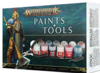
Warhammer Age of Sigmar Paint & Tools Set

Both of these boxes are robust offerings designed to work with the 'starter boxes' products listed above.