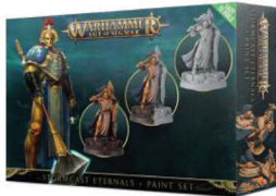
Stormcast Eternals + Paint Set