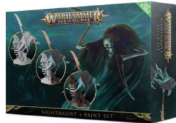
Nighthaunts + Paint Set